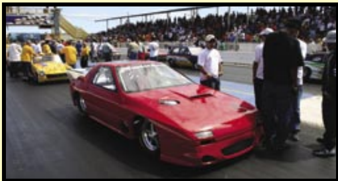
Team USA's top qualifier "Monkey Racing"