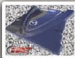
RX-8 Carbon fiber engine cover Price: $280.00 USD