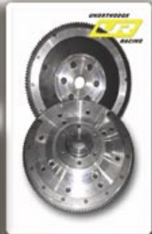
Aluminum Flywheel from Unorthodes Price: $525.00 USD