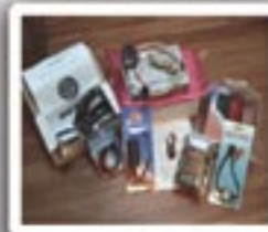
SVideoKIT1 Price: $712.00 USD